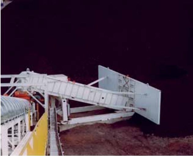
Reclaim Feeder processing 2" x 0" coal at a synthetic fuel plant at a rate of 400 TPH.