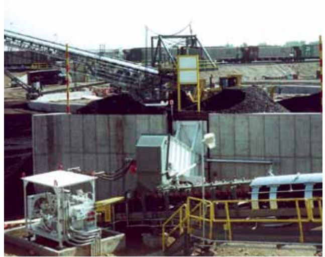
This fixed mount reclaim feeder installed in a slot in the concrete retaining wall delivers 500 TPH of coal directly to the power plant.