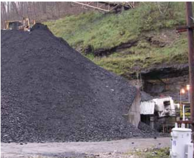
Reclaim Feeders can handle up to 4,000 TPH and can be designed with higher tonnage capacity if required.