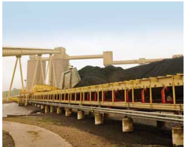
The discharge end of the Reclaim Feeder can be designed to meet your exact belt conveyor interface.